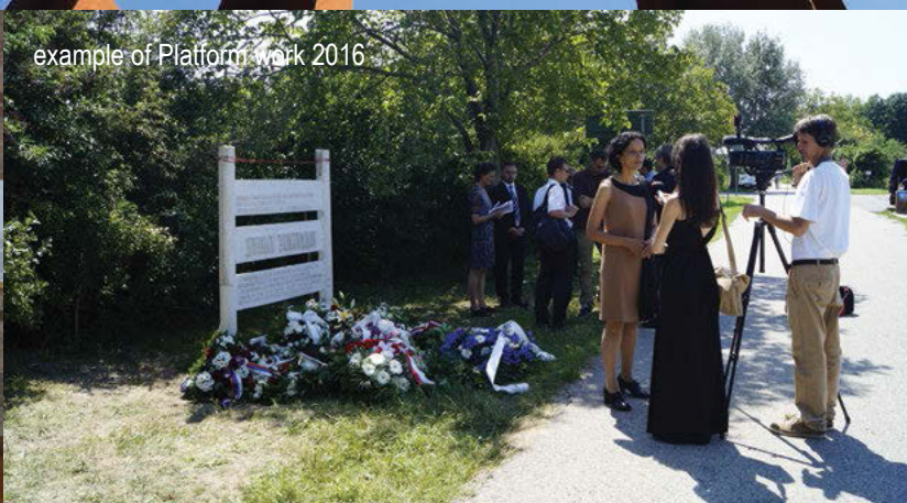
example of Platform work 2016