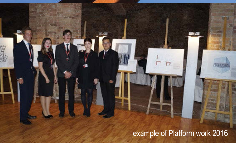
example of Platform work 2016

The establishment of the Platform of European Memory and Conscience was endorsed by the European Parliament and the Council of the European Union.